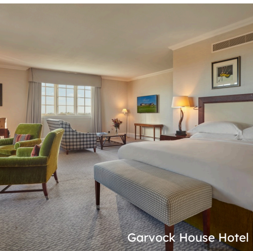
Garvock House Hotel