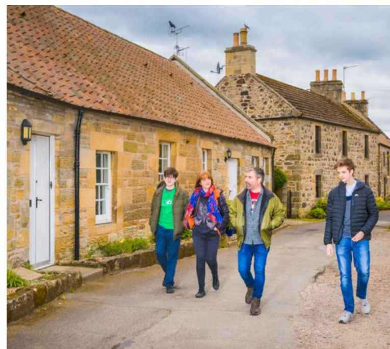
Fife Pilgrim Way Ceres