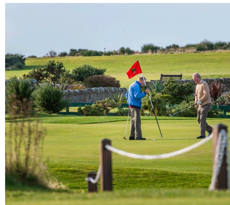
Home of Golf